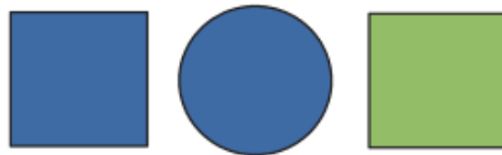
Figure 3. From Frank & Goodman (2012)

The same thing goes for other pragmatic frameworks like the Rational Speech Act framework (RSA). RSA provides an account of how speakers and hearers use Bayesian inference to recursively reason about what state of the world is likely to be like given that a speaker made some utterance while reasoning about how a listener is likely to interpret that utterance. A simple RSA model might assume a uniform prior probability distribution on which objects (or restrictions) are all equally likely. But, RSA is compatible with it being the case that our prior probabilities supply a higher likelihood to restrictions being made by, say, location than by history, how funny something is, or its color. For instance, Frank & Goodman (2012) and Qing & Franke (2015) consider priors related to perceptual salience (how attention-grabbing something is in one's environment). Consider a simple conversational setup in which a speaker and a hearer are engaged in using signals to refer to some object in the array shown in Fig. 3 .